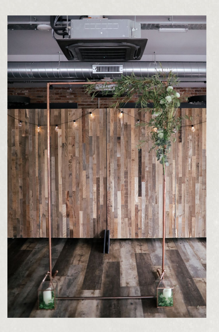
Our backdrops can be hired for £200